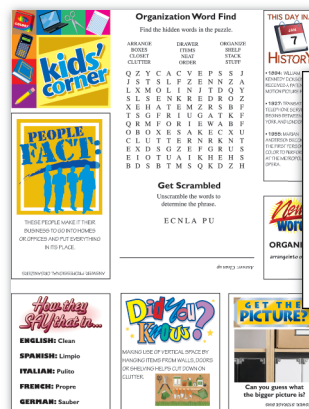
Crypto Fun & Guess Who?