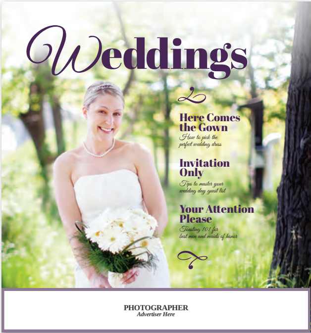
Custom Cover with Ad Placement