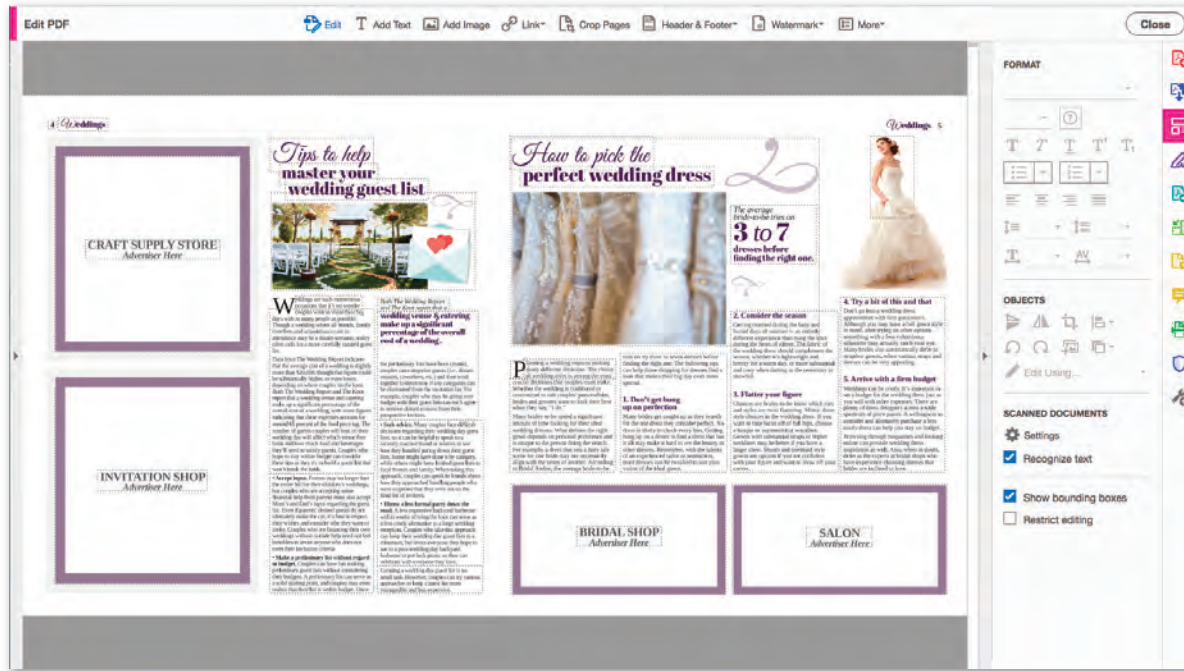
Edit text from the TSS pdf

Delete advertiser suggestions or show spec in place.