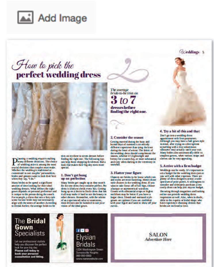
Add spec ad