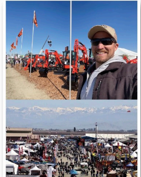
Planting the Seeds, Gathering the Harvest Tim Dinkins (The Sentinal)